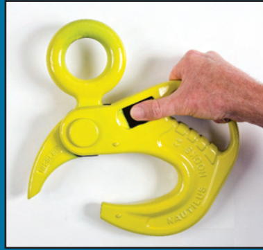
We make the Hook