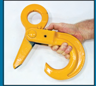
You make the Choice

Nautilus Hooks™ are the cost effective solution to eliminating serious, and potentially costly, pinch and trap hand injuries during lifting operations. A revolutionary new design, Nautilus Hooks, incorporate unique safety features that eliminate the inherent hazards of traditional hooks and set a new global safety standard for a broad range of industries and applications including: