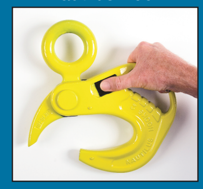
We make the Hook